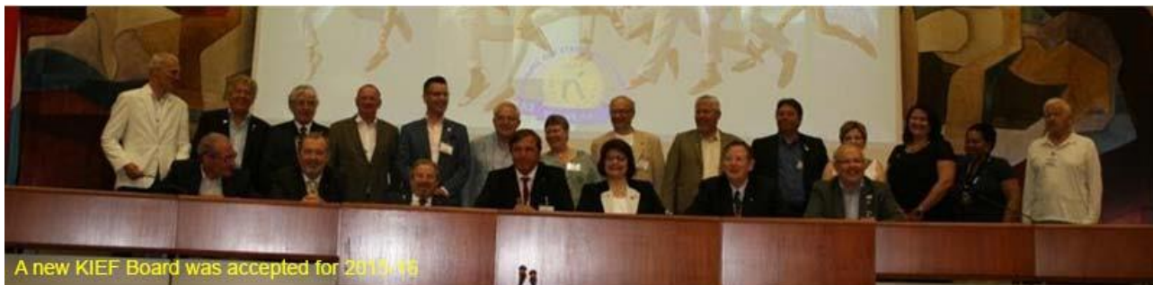
A new KIEF Board was accepted for 2015-18