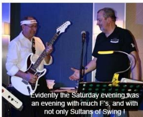
Evidently the Saturday evening was an evening with much F's, and with not only Sultans of Swing !