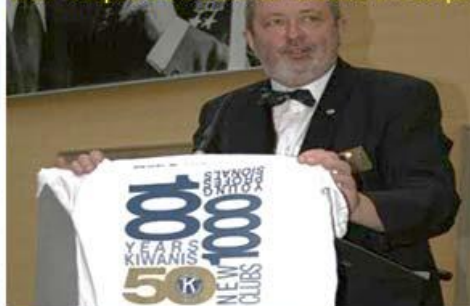
KIEF shapes the Future for Kiwanis in Europe

All the pictures of the Convention are downloadable at following link: https://photos.google.com/share/AF1QipNsa9nPoeNbrC14JoTRsnfqY98t40b0PeIGOzQrm69Cep1DLK3idTADF1bYEkJ0nw?key=OE5EUI84dnRodG1rbE1jUWlyYI02ZF5vJV2WU9n