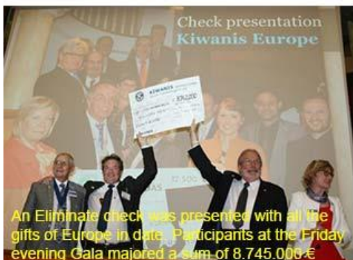
An Eliminate check was presented with all the gifts of Europe in date. Participants at the Friday evening Gala majored a sum of 8.745.000-€