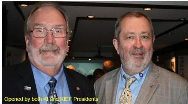
Opened by both KI and KIEF Presidents