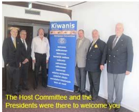
The Host Committee and the Presidents were there to welcome you