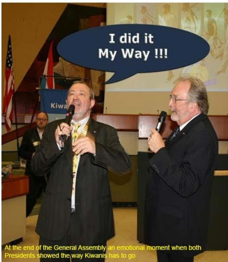
At the end of the General Assembly an emotional moment when both Presidents showed the way Kiwanis has to go

All the pictures of the Convention are downloadable at following link: https://photos.google.com/share/AF1QipNsa9nPoeNbrC14JoTRsnfqY98t40b0PeIGOzQrm69Cep1DLK3idTADF1bYEkJ0nw?key=OE5EUI84dnRodG1rbE1jUWlyYI02ZF5vJV2WU9n