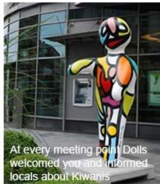
At every meeting point Dolls welcomed you and informed locals about Kiwanis