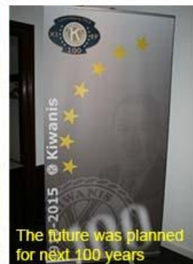
The future was planned for next 100 years