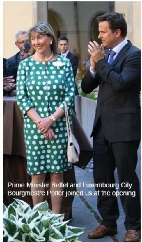
Prime Minister Bettel and Luxembourg City Bourgmestre Polfer joined us at the opening