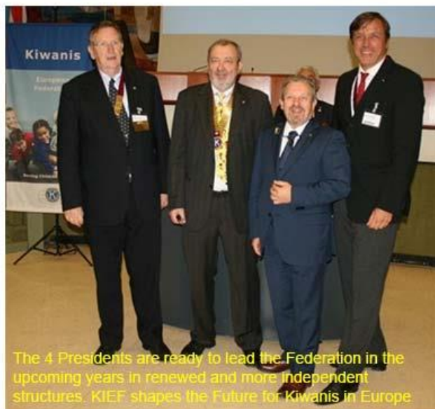
The 4 Presidents are ready to lead the Federation in the upcoming years in renewed and more independent structures. KIEF shapes the Future for Kiwanis in Europe